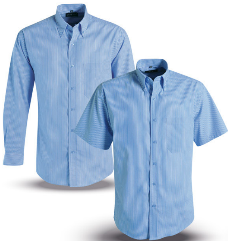
CAMERON STRIPE DESIGN 5