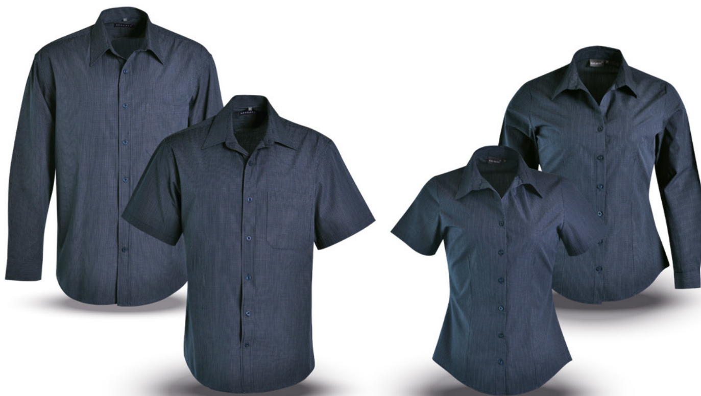
MATTHEW CHECK DESIGN 1