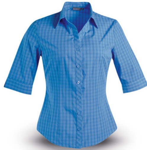
DONNA CHECK DESIGN 3