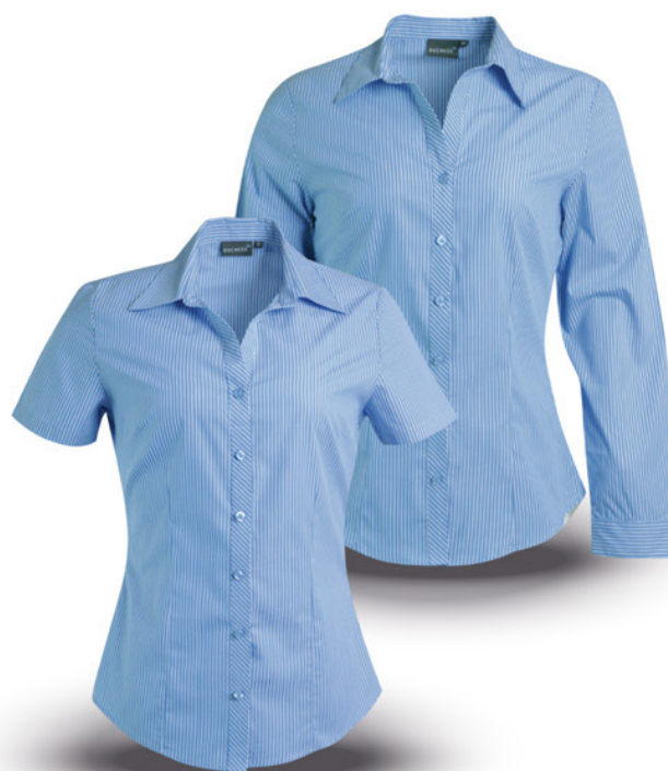
DONNA STRIPE DESIGN 5