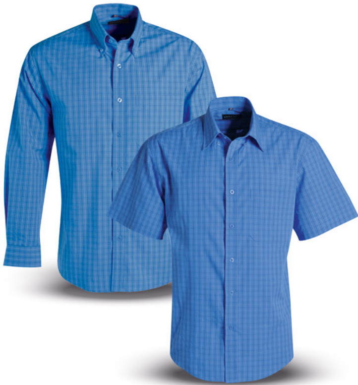
CAMERON CHECK DESIGN 3